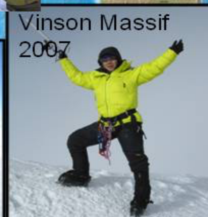
Vinson Massif 2007