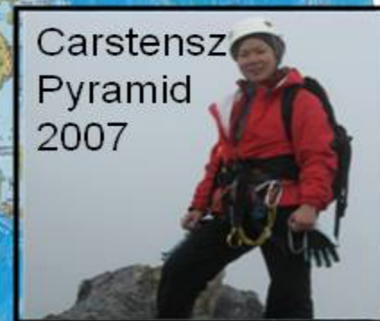
Carstensz Pyramid 2007