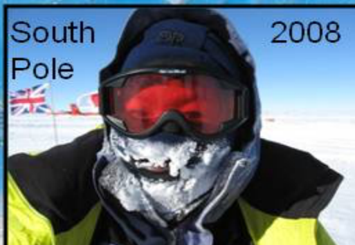
South Pole 2008