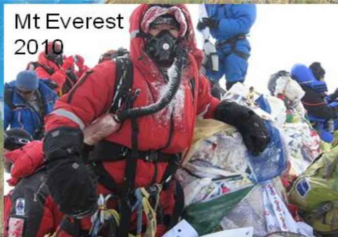
Mt Everest 2010