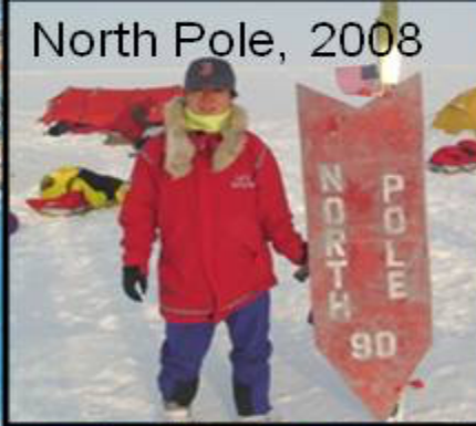
North Pole, 2008