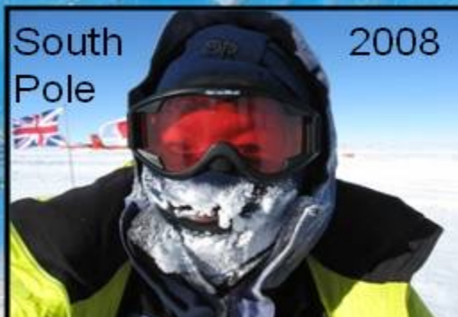
South Pole 2008