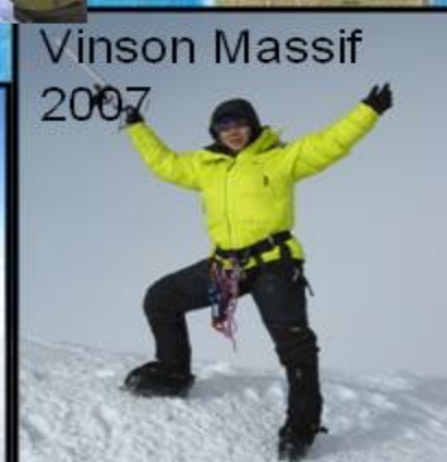
Vinson Massif 2007