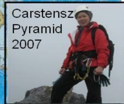
Carstensz Pyramid 2007